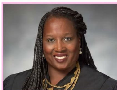
HON. SHERRY THOMPSON-TAYLOR, SUPERIOR COURT JUDGE

Superior Court candidate and former Administrative Law Judge with extensive experience leading specialized units in domestic violence and gun violence prevention.